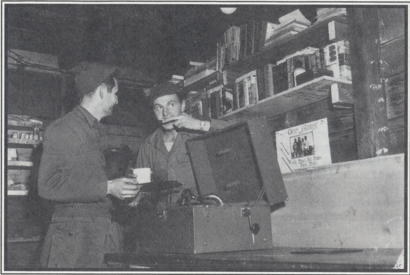
A cup of java, music, literature and good company help pass the time for two servicemen stuck in an Aleutian outpost.